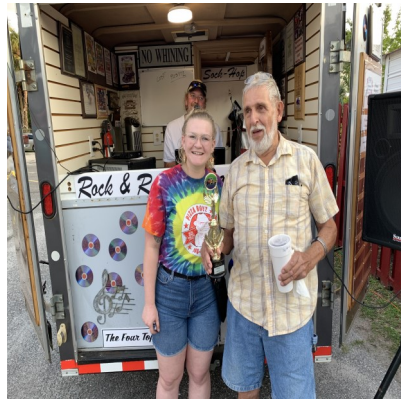
Victor D'Agostino Trophy Winner