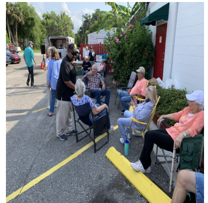
Everyone having a good time