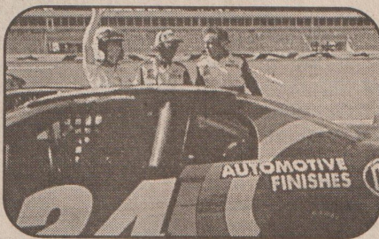
Marilyn all smiles!

at least 20 feet apart go by like a picket fence, going into a turn at that speed and feeling the G forces trying to push you through the bottom of your seat, and then trying to lift a helmet that all of a sudden feels like it weighs 200 pounds, this is the greatest feeling in the world.